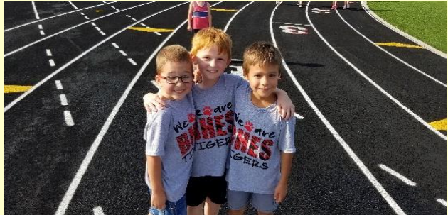
Thank you for donating to the PTO Walk-a-Thon!